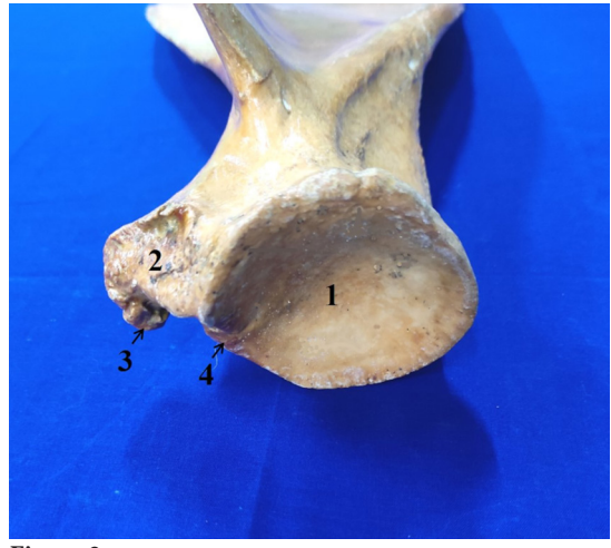
Figure 3. Distal aspect of Scapula. 1= Glenoid cavity, 2= Supraglenoid tuberosity, 3= Coracoid process, 4= Glenoid notch.

muscle attached, was less prominent. This contrasts with horses, where the deltoid tuberosity was more pronounced [5]. Additionally, a small prominence known as the teres minor tuberosity was located proximal to the deltoid tuberosity, further enhancing the muscle attachment site (Figure 4, 5). Notably, these tuberosities were absent in giraffes [14, 15], differing from the observations in the present study. In sheep, the deltoid tuberosity was less prominent and closer to the proximal end [5], showcasing variations in muscle attachment across species. The lateral head of the triceps brachii muscle was attached to the humeral neck on the lateral surface by a curving line proximal to the deltoid tuberosity. The cranial surface of the shaft of the humerus ended at the radial fossa distally. The caudal surface is smooth, almost straight, rounded from side to side, and ends distally at the olecranon fossa (Figure 4). The nutrient foramen was located almost at the middle of the caudal surface of the humerus (Figure 4) like sheep [5], and Black Bengal goats [21]. According to [5], the nutrient foramen of cattle is placed in the distal third of the caudal surface of the humerus, but that of horses is positioned in the distal third of the medial surface of the humerus. In Asiatic cheetah, there were two main nutrient foramina on the shaft of the humerus: one was on the roof of the olecranon fossa, and the other was proximal to the su-