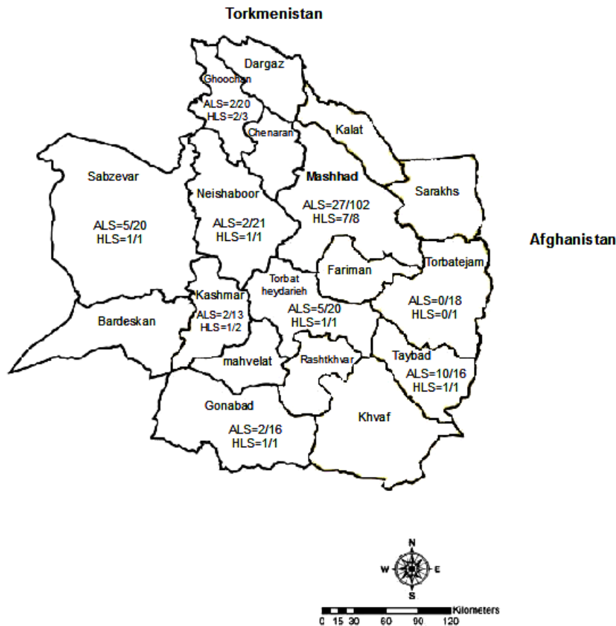
Figure 2. Geographical distribution of animal Levelseroprevalence (ALS) and herd level seroprevalence (HLS) in KhorasanRazavi province. Values shown as ALS are number of positive animals divided by total number of tested animals and for HLS are number of positive herd(s) divided by total number of tested herd(s).

Numerous studies have been conducted to evaluate the serological prevalence of coxiellosis in farm animals. Seroprevalence of Coxiella Burnetii had been various in different parts of the world. Animal level of seroprevalence of Coxiella Burnetii in dairy cows was 6.2, 7.8, 14.3, 14.5, 22.7 and 24% in five studies conducted in Northern Ireland, Germany, Central African Republic, Mexico and Cyprus, respectively (McCaughy, et al. , 2010; Psaroulaki et al. , 2006; Nakoune et al. , 2004; Hellenbrand et al. , 2001; salman et al. , 1990). Herd level of seroprevalence was 57% in Mexico and 48.4% in Northern Ireland (McCaughy, et al. , 2010; salman et al. , 1990). Also, seropositive human and animals are reported from countries around Iran. In Turkey (north-western neighbour of Iran) 20%