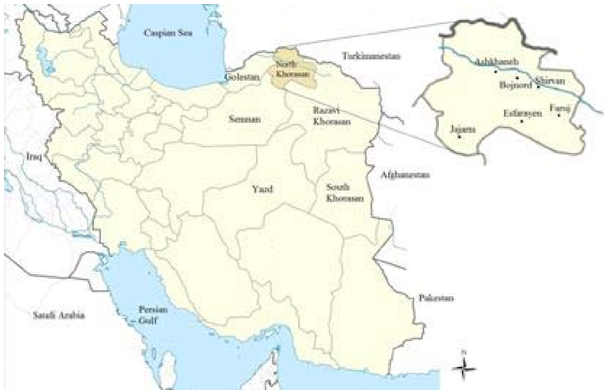
Figure 1. The map of Iran and location of the study area.