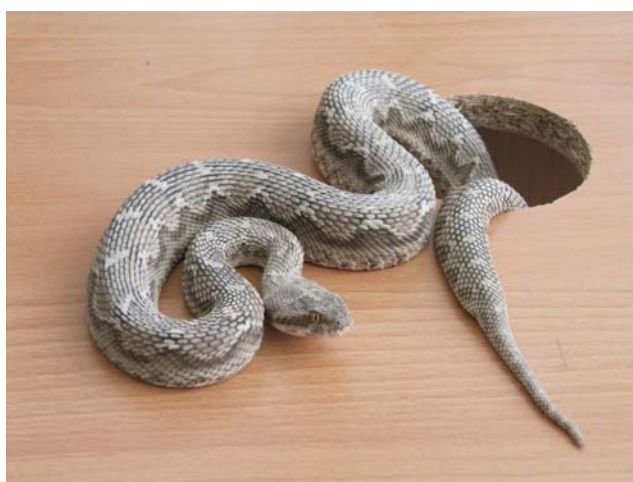
Figure 1: Iranian snake "Echis carinatus" known as "Jafari snake"

A: Injected venom only, B: Suramin has been injected 15min after injection of venom, C: Suramin and venom were incubated together 15min before injection into animals, D: Venom has been injected 15min after injection of Suramin, E: Injected Suramin only.