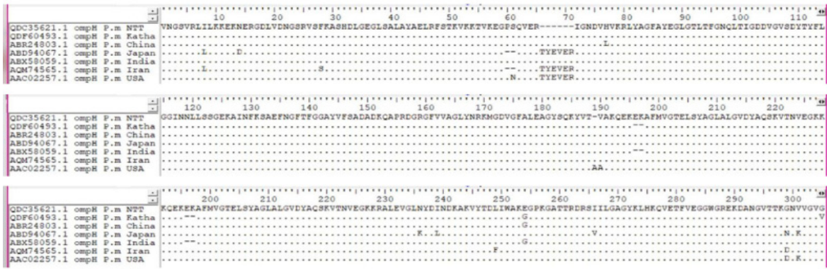
Figure 1. Multiple alignment of amino acid sequences of 37 kDa gene OmpH P. multocida NTT isolates compared with and isolates from GenBank