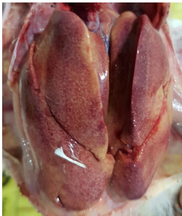
Figure 3 A liver showing petechiae and ecchymosis signs, as well as being enlarged and pale.

The poultry of slaughterhouse having hepatic and respiratory liver and lung involvements were evaluated. The liver and lung samples were taken from 20 different flocks; Each flock was compris-