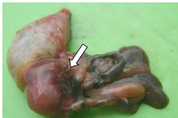
Figure 1: Marked edema, congestion and hemorrhage on the distal part of the gizzard and proximal part of the duodenum (white arrow).

Gross necropsy revealed marked edema, congestion and hemorrhage on the distal part of the gizzard and proximal part of the duodenum (Fig. 1). Moderate numbers of ulcer-like lesions were observed on the proventricular epithelium.