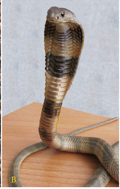
Figure 1. A) Peganum harmala seeds, B) Iranian snake Naja naja oxian (Prepared by B. Fathi)