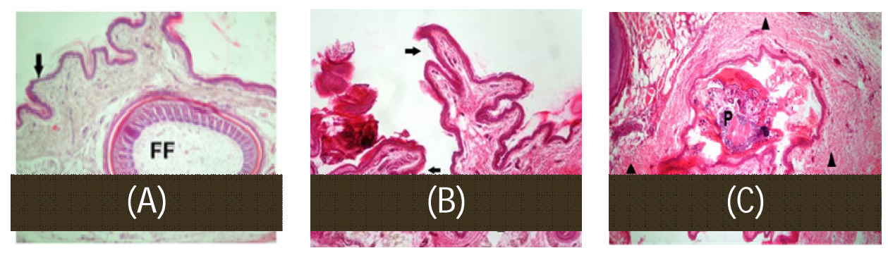
Figure 2. H&E staining of the skin. (A) Normal skin layers (arrow) and a feather follicle (FF) in healthy leg as a control (×100). (B) Epidermal folding (arrows) and edema (arrows head) in sub cutis due to the adult ticks infestation (×100). (C)

Iranian Journal of Veterinary Science and Technology, Vol. 7, No. 2