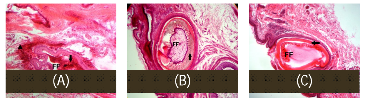
Figure3. Stages of feather follicles degeneration and Necrosis due to the nymph infestation (H&E staining). (A) Hemorrhage in feather follicle (arrow) and its surroundings (arrows head) (×100). (B)Degeneration of Feather follicle epidermis layers in 1 week (arrow).arrow head show the normal Feather follicle layers (×100). (C) Necrosis of Feather follicle epidermis layers in 2 weeks (arrow) (×100).

Epidermal folding (arrows) and increase the subcutaneous connective tissue (arrows head) due to the nymph (P) irritation