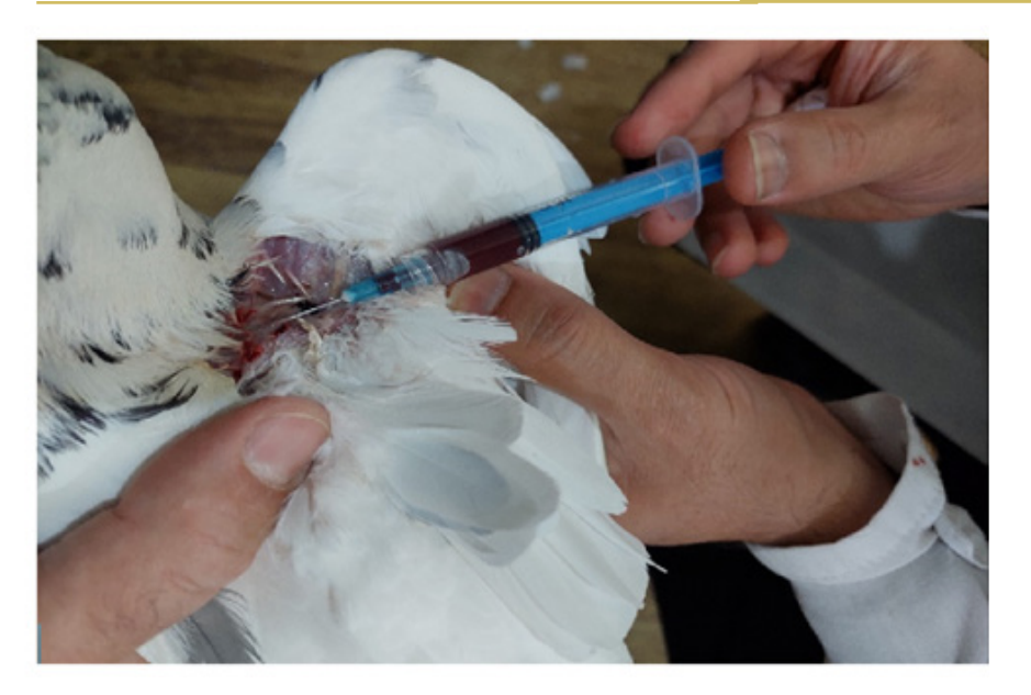
Figure 2. Blood sampling from the wing vein

in pigeons and preventing its side effects. Therefore, it can be said that silymarin is a suitable treatment choice for pigeons and perhaps other birds affected by liver and kidney diseases.