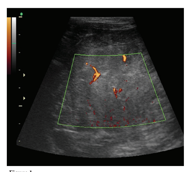
Figure 1. Ultrasonography of the mass.

In conclusion, a hemangiopericytoma was diagnosed based on the physical examination, radiography, ultrasonography, histomorphology, and immunohistochemical reactivity in the cat. To the authors' knowledge, this is the third reported hemangiopericytoma and the largest among them in cats. This tumor is rare in cats; therefore, the diagnosis of HPCy in cats needs more information.