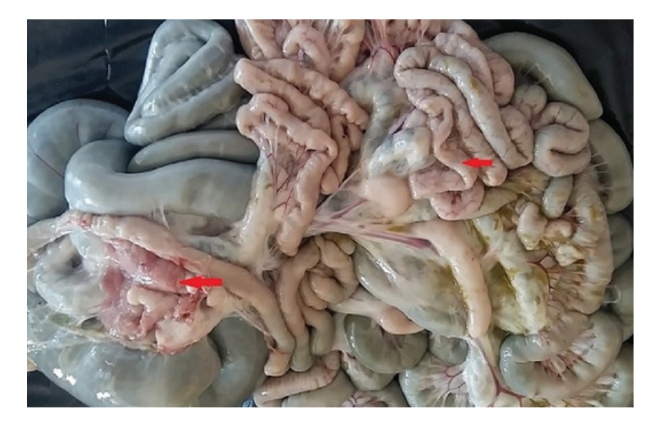
Figure 2. Cerebriform or gyrate pattern and depressions on the serosal surface of jejunum (arrows) at 42 DAI.