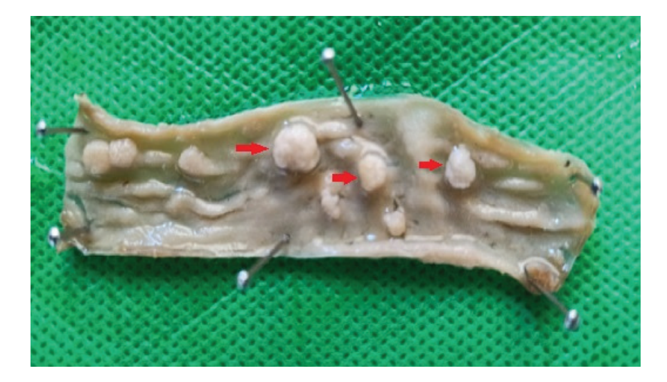
Figure 1. The whitish nodules (arrows) on mucosal surface of the jejunum at 35 DAI