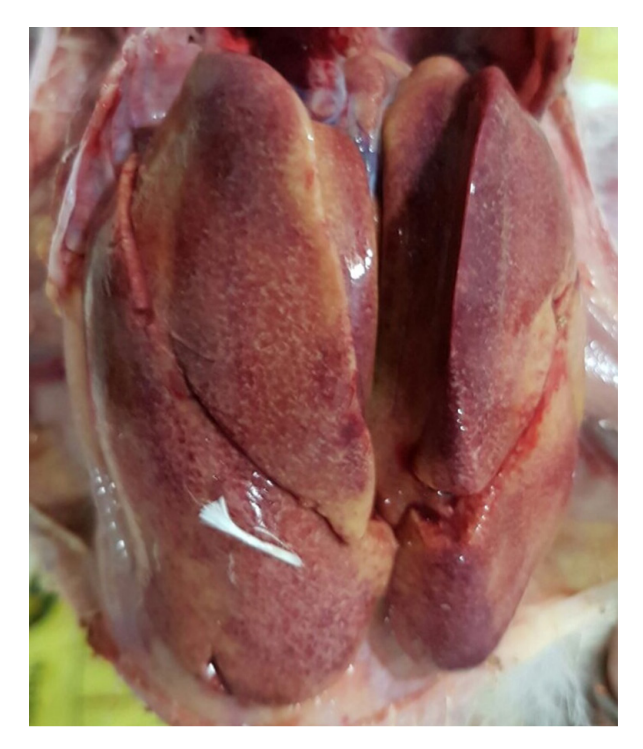
Figure 3 A liver showing petechiae and ecchymosis signs, as well as being enlarged and pale.

itive sample showed that this adenovirus belonged to FAdV-11, which is in the D genotype group. Hoseini et al. (2012) identified FAdV-11 serotype from mortalities of three-week-old chicken farms [5]. They concluded that this serotype is able to cause clinical diseases and mortality in chickens. In Nateghi et al. (2014) study, FAdV 8b, 2 & 11 were identified [2]. In Herdt et al. (2013) survey, FAdV isolates belonged to the serotypes FAdV 1, 2/11, 3, 5 and 8a [1]. FAdVs correlated with IBH