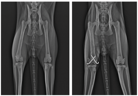
Figure 2. An example of a cross pin application