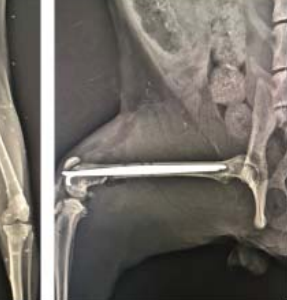
Figure 1. An example of Rush pin implementation