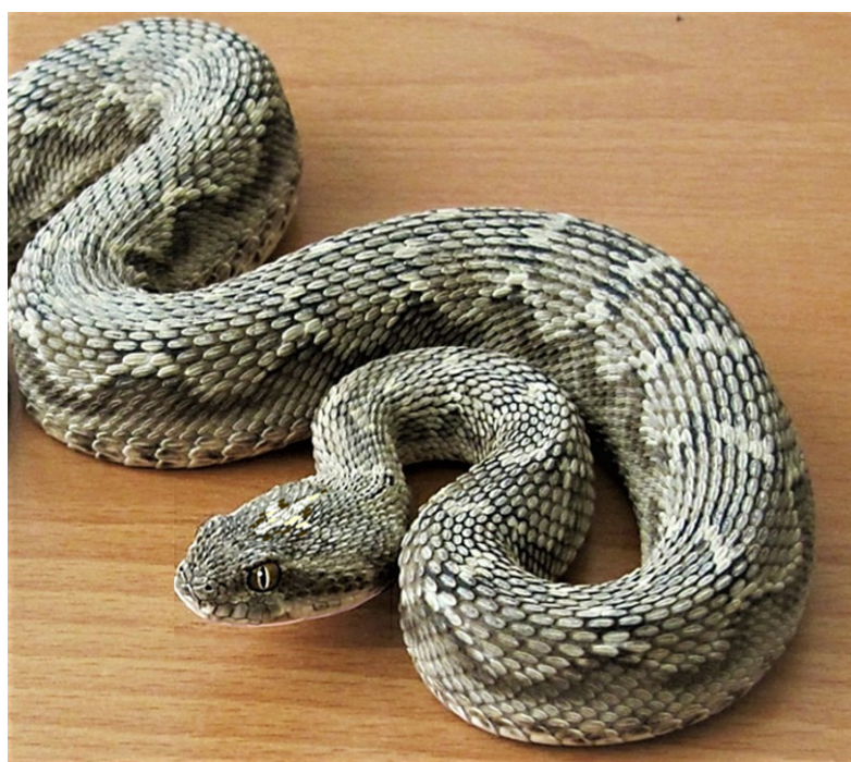
Figure 1. Viper snake Echis carinatus , also called saw-scaled viper (prepared by B. Fathi)

It is worth noting that while herbal medicines have their advantages, the efficacy of many of them have not been scientifically investigated, nor have their active components been identified and isolated [13]. In some tribal areas of India, sometimes local populations rely on plant extracts to manage the severe local effects of Daboia russelli russelli (Russell's viper) envenomation, without any scientific validation